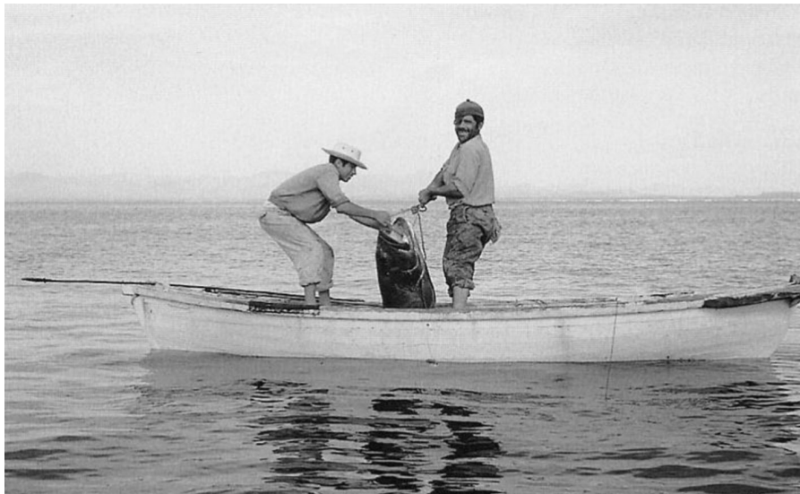
Figure 2. Photograph of two fishers hauling a good-sized Gulf grouper. Although the photograph is not dated, the harpoon, the canoe and fishers' clothes characterize the middle of last century. Reproduced with kind permission of Gene Kira (Kira 1999).

Descriptions by early twentieth century naturalists portray a seascape where Gulf groupers dominated the reef ecosystem (Sáenz-Arroyo et al. in press). In 1932 the naturalist Griffing Bancroft wrote of Gulf groupers from San Idelfonso Island in the central Gulf of California